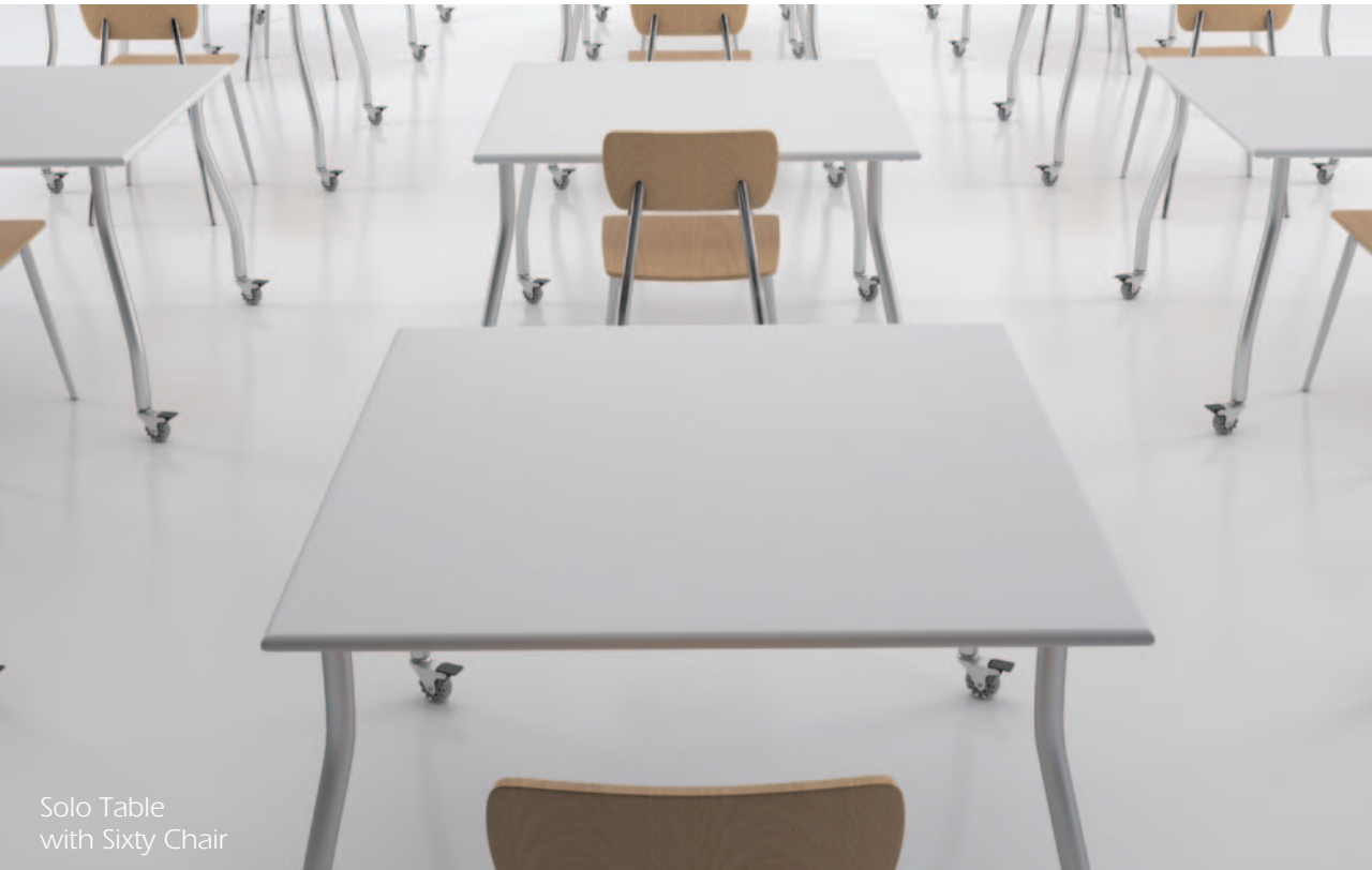
Solo Table with Sixty Chair