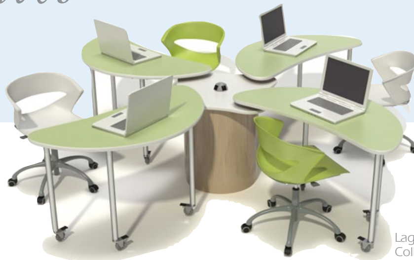
Lagoon Collaborative Desking

Libraries are vital places to stay connected.