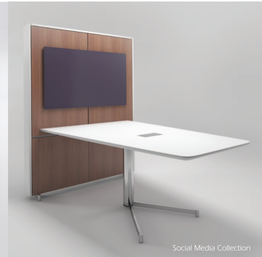
Social Media Collection